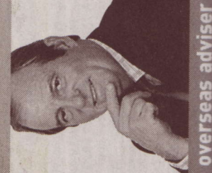
The overseas adviser

The Algarve, and the area around Cabanas, in particular, have potential for further growth. I would suggest you can expect annual growth of about 5% a year there, so you need to