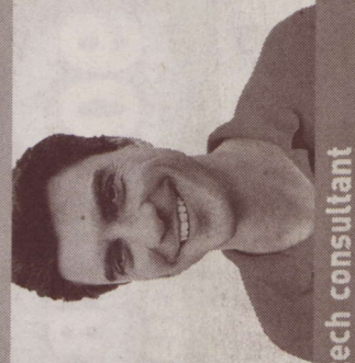
The tech consultant

e-mail your questions to propertyexperts@sunday-times.co.uk